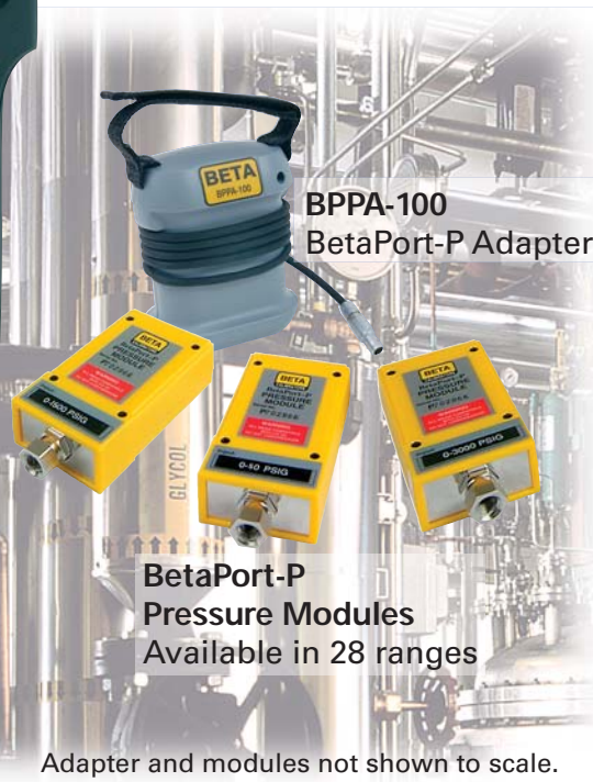
BPPA-100 BetaPort-P Adapter